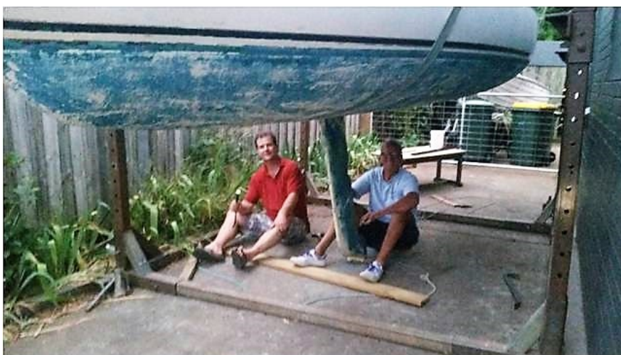
Keel bolt-ectomy begins