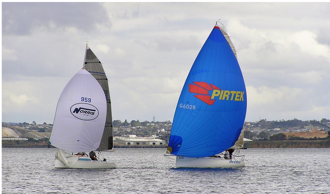
Jake Newman's Elliot 5.9 "Broken Blade" closely followed by Bernard Spooner's Elliot 7.8 "Out of Exile"

Race day was overcast with light winds of 5 knots which eased during the race but finished with 8 to 10 knots, no rain was predicted and the sky was mostly sunny. The stage was set for a great day with 27 competitors all fired up to get the fastest time around the pelican silhouette shaped course. The start was orderly for the three divisions (division 4 was not represented due to insufficient competitors).