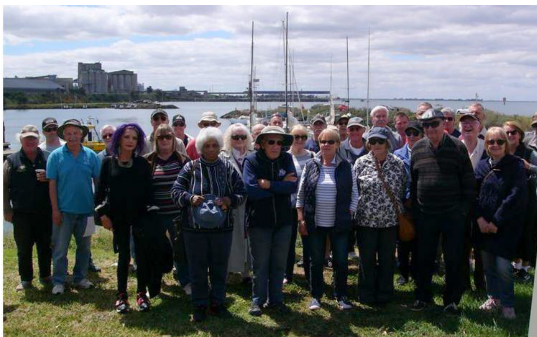
Seniors ready to go sailing at St Helens