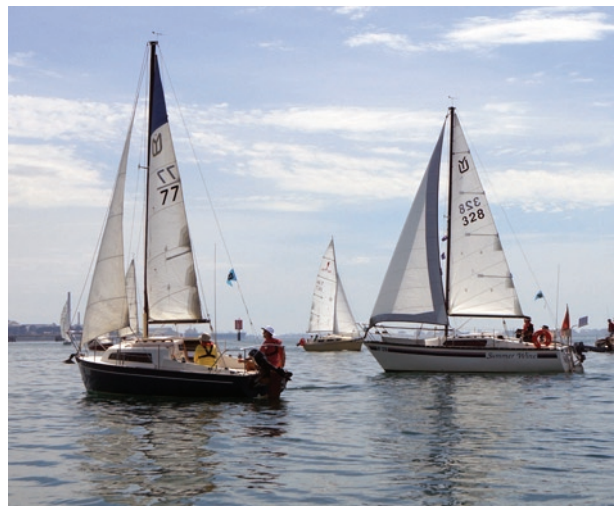
A few Ultimate 18s join in the GTYC Opening Day Sail Past