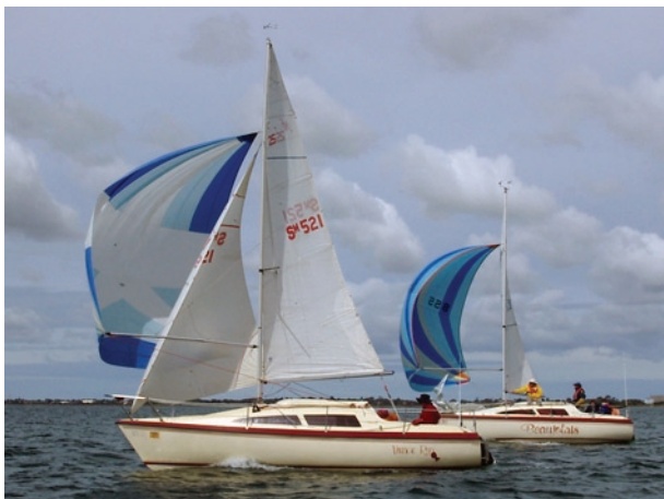
Vintage Red leads Beaujolais on a merry kite chase

Race 4 of the GTYC Spring Series was sailed on Sunday 16 September in lively conditions: just great for kite-flying, as these photos by Colin Onley testify.