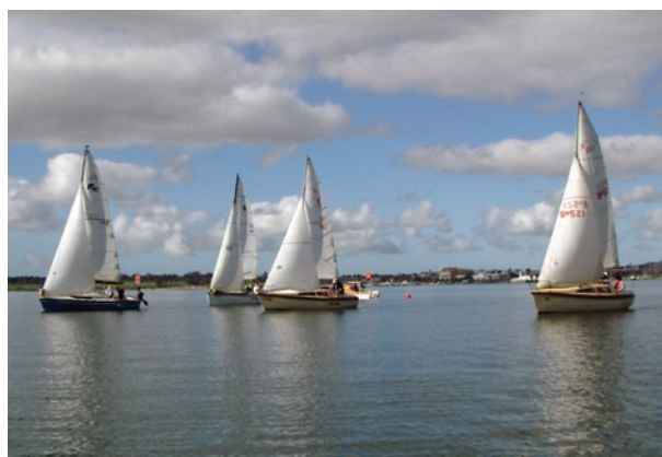
The light conditions tested the patience and skills of all