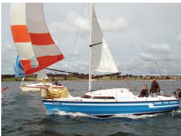
Farrical also breaks out the kite for some colourful action