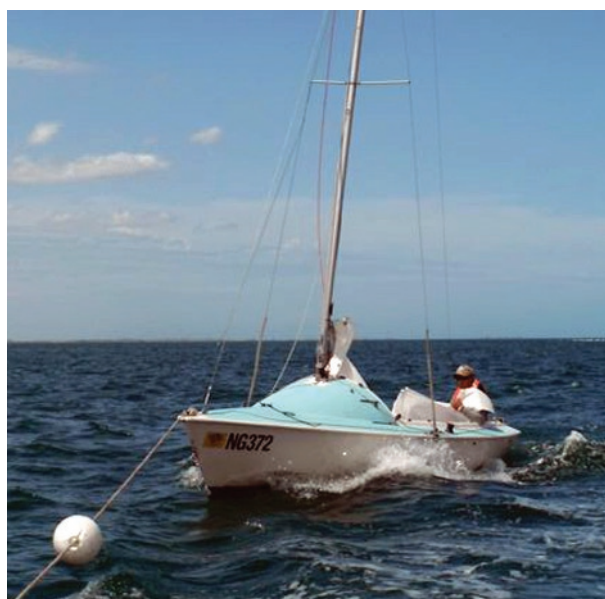
OOH La La accepts a welcome tow home from Even Keel