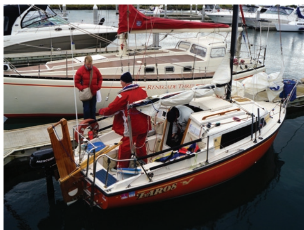
Len and crew aboard Laros prepare to head out The Cut