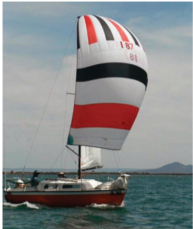
Jaffa powers up with the You Yangs in the distance

Jaffa had a big lead as she passed the first exclusion zone mark, followed by Tarquin and Restless running well, then Mr Bond blasting past OOH La La , hotly pursued by Five O'Clock Somewhere . The boats in full colour looked truly spectacular with their kites ablaze.