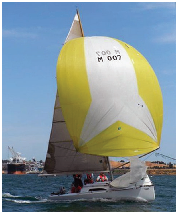
Mr Bond sets out for the North Channel with kite flying