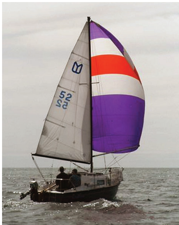
Restless hoists the spinnaker for a winning run