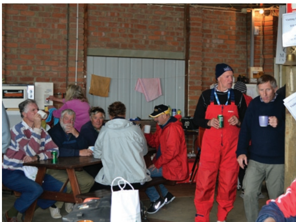
Skippers and crew retire to the club rotunda after the race