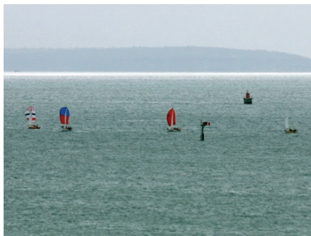
The fleet starts off under spinnakers towards Indented Head