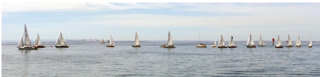
Club boats (and visitors) line up in very light conditions for the traditional sail past to open the 2012-13 sailing season