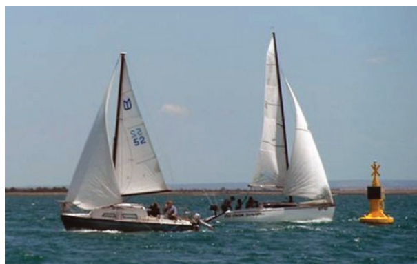
Restless and Five O'Clock Somewhere at the Arthur mark