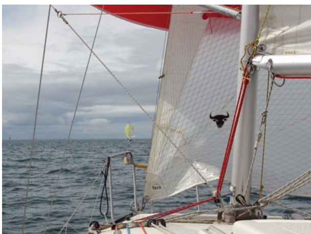
A view over the bow of Dream On of the leading boat