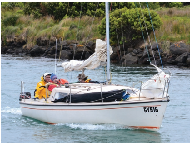
Another bot heads out The Cut ready to contest the big race