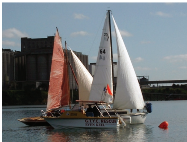
Boats mill about the start line in mill-pond conditions

GTYC Officer of the Day 2012 Cluster Cup Race