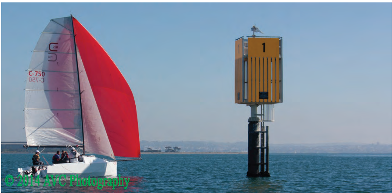
Fat Bottom Girl uses her kite to advantage as she edges her way to the Number 1 channel mark in very light conditions