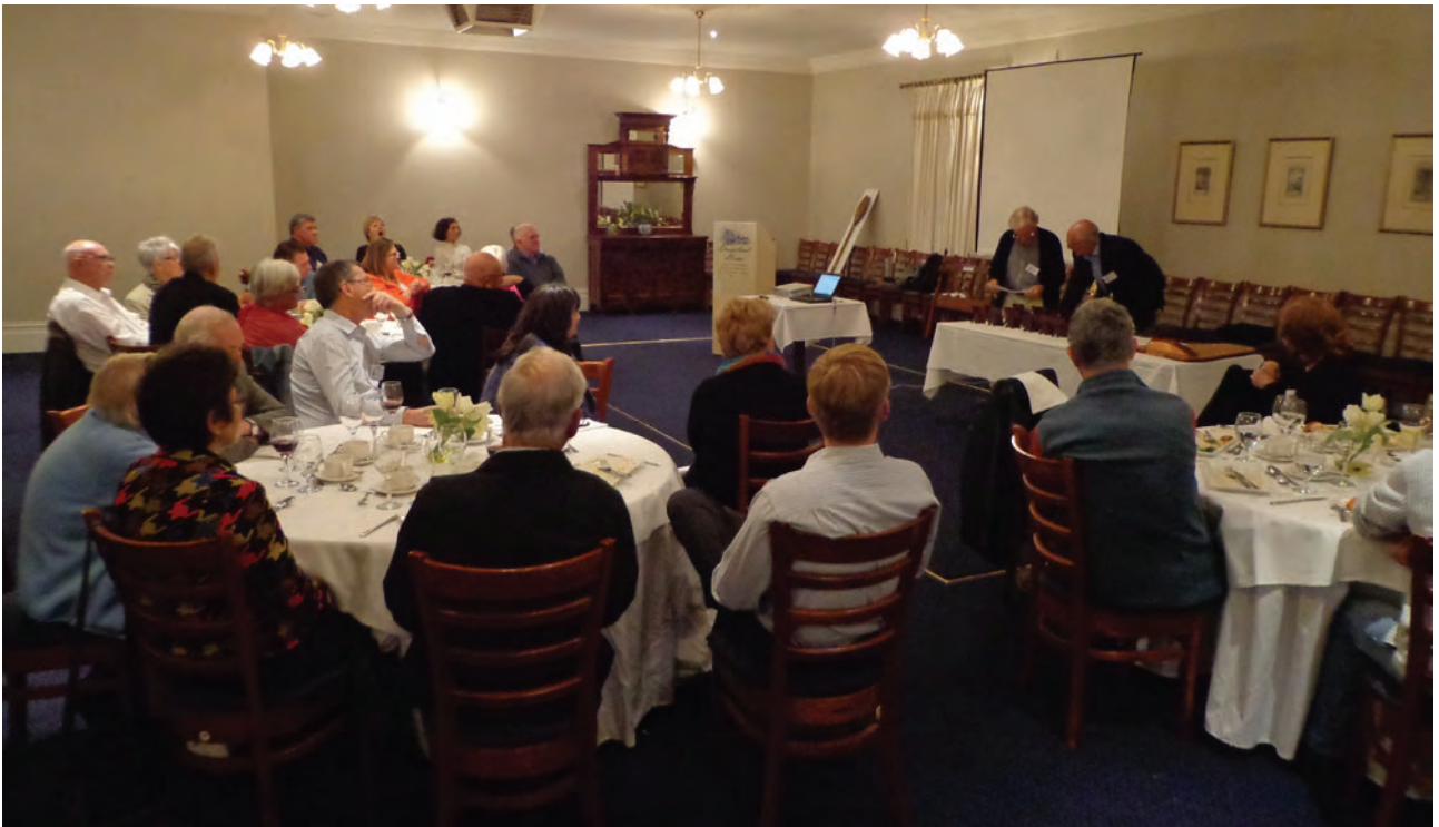
Another GTYC annual general meeting and trophy awards night is punctuated by good food, tall tales, strenghtened friendships new and old, and a laugh or two to boot!