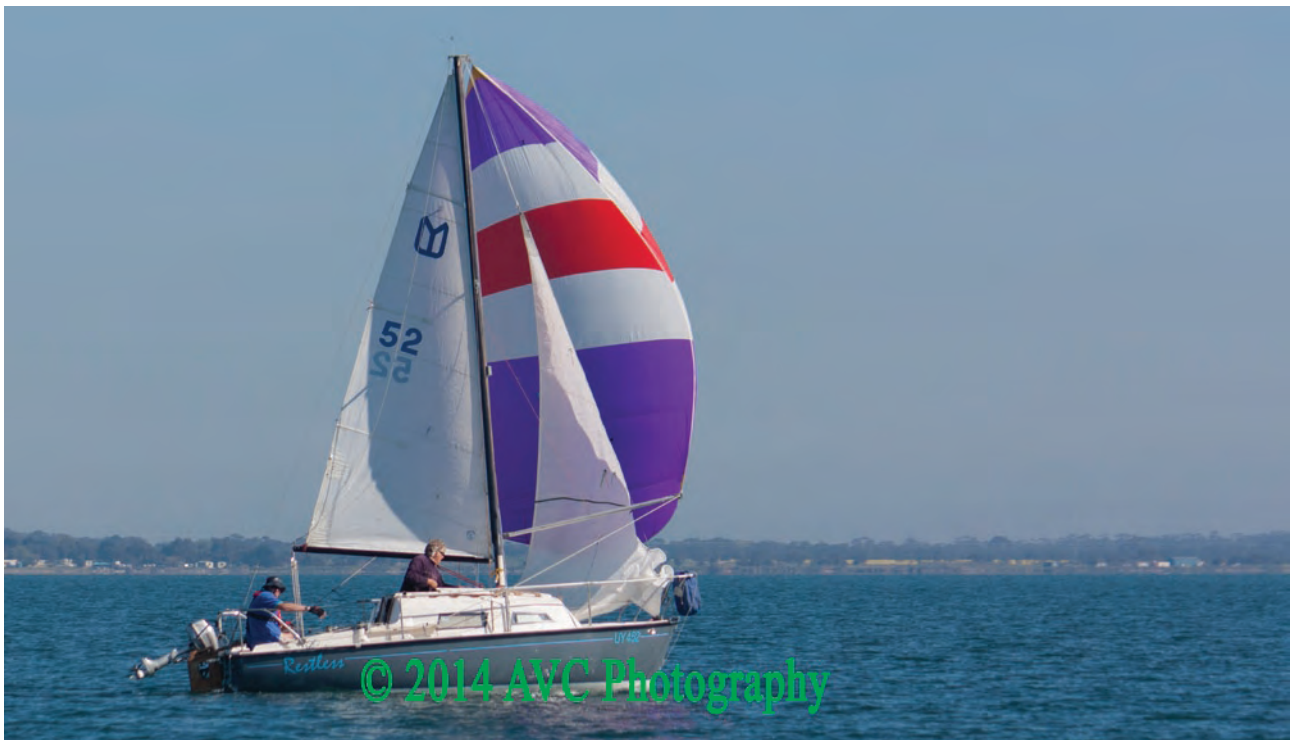
Ray Slee and crew aboard Restless (Ultimate 18) making the best of the frustratingly light airs sailing the Cluster Cup