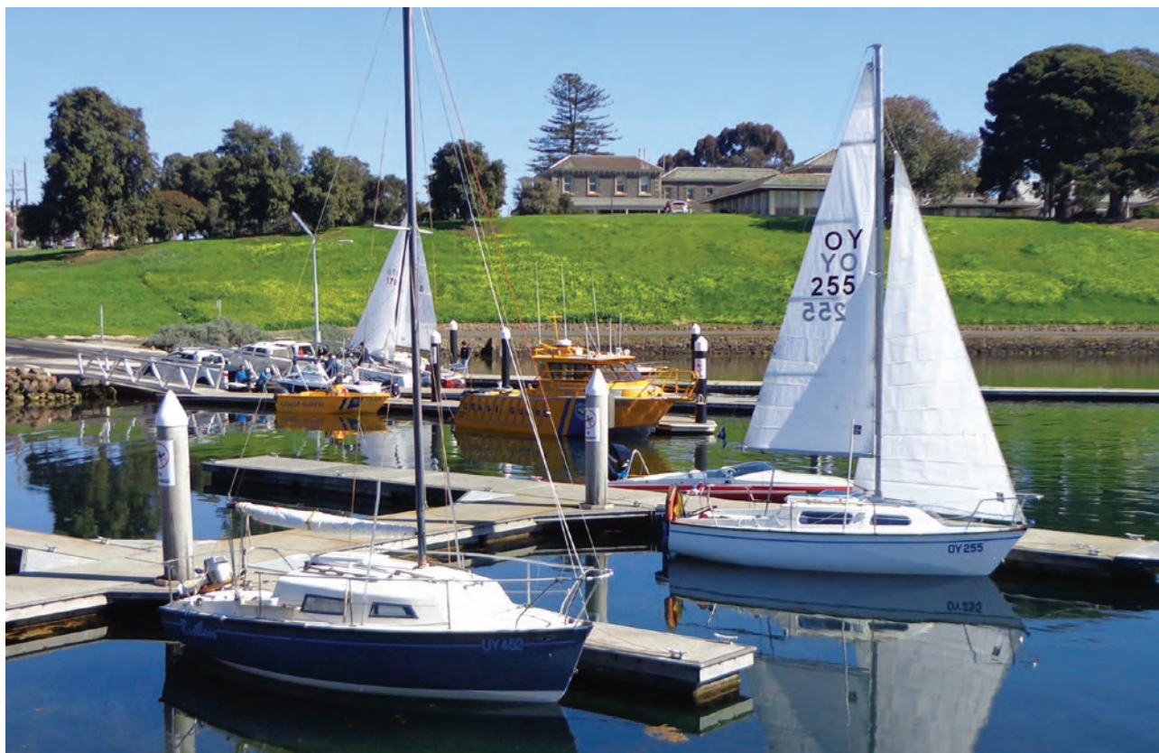
GTYC member boats Restless (Ultimate 18) and QUMBU (Investigator 563) enjoy a peaceful mooring at St Helen's Marina

The quarterly newsletter of the Geelong Trailable Yacht Club Inc.