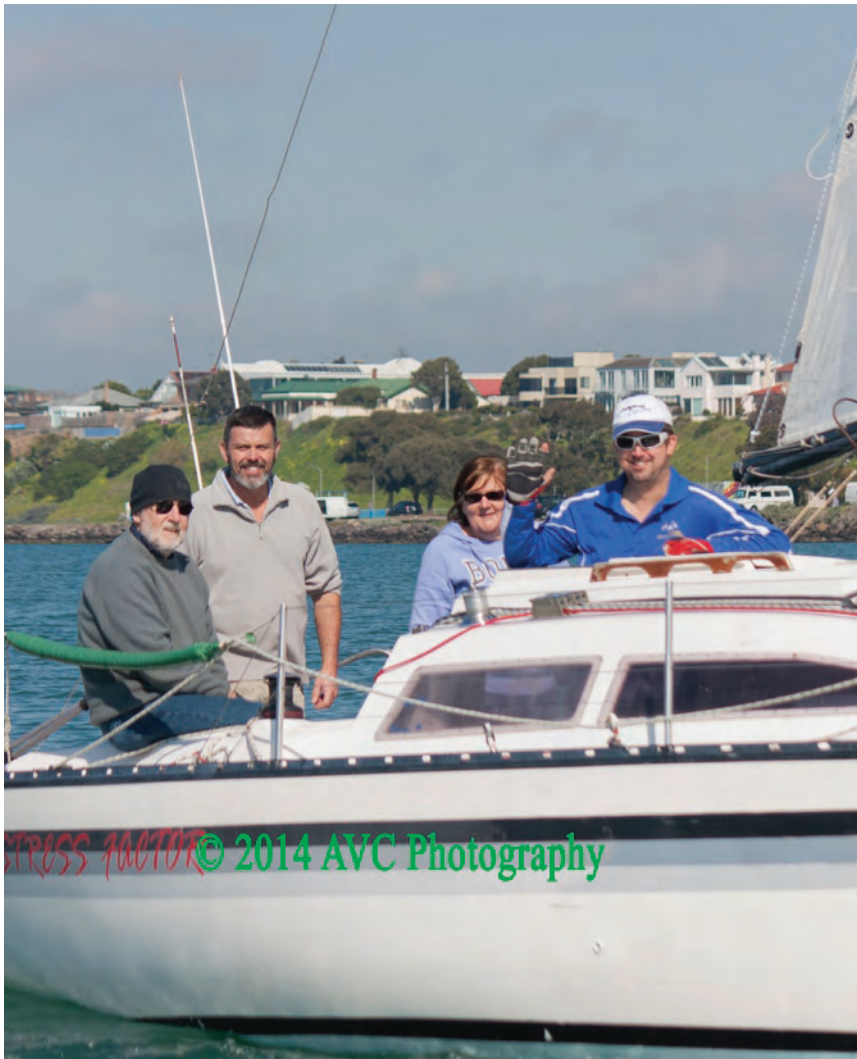
The skipper and crew of Division 2 boat Stress Fracture greet the committee boat prior to the start of the 2014 Cluster Cup Race.