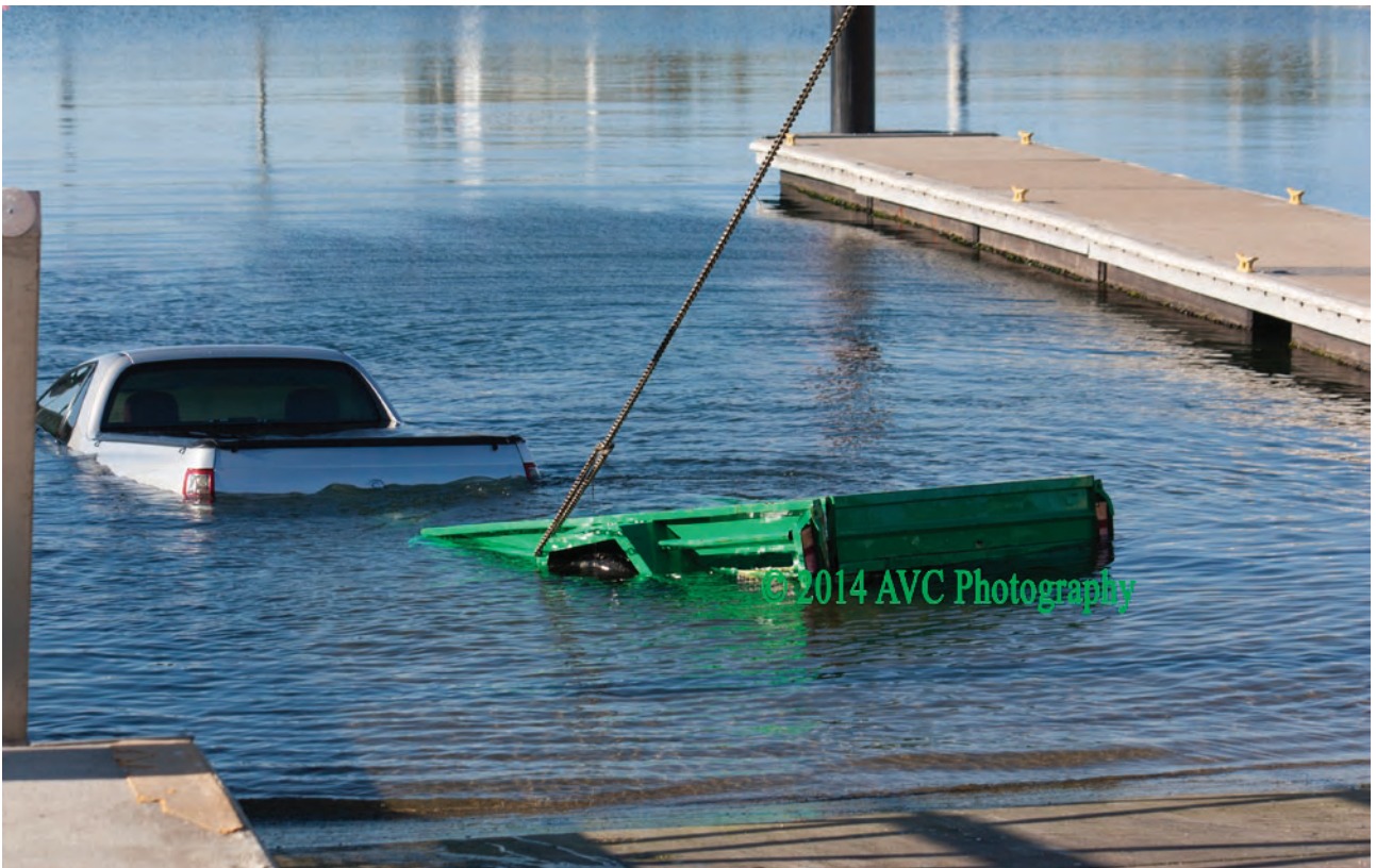
The owner of this ute at St Helen's is a definite contender for next year's Mariner's Nightmare award!