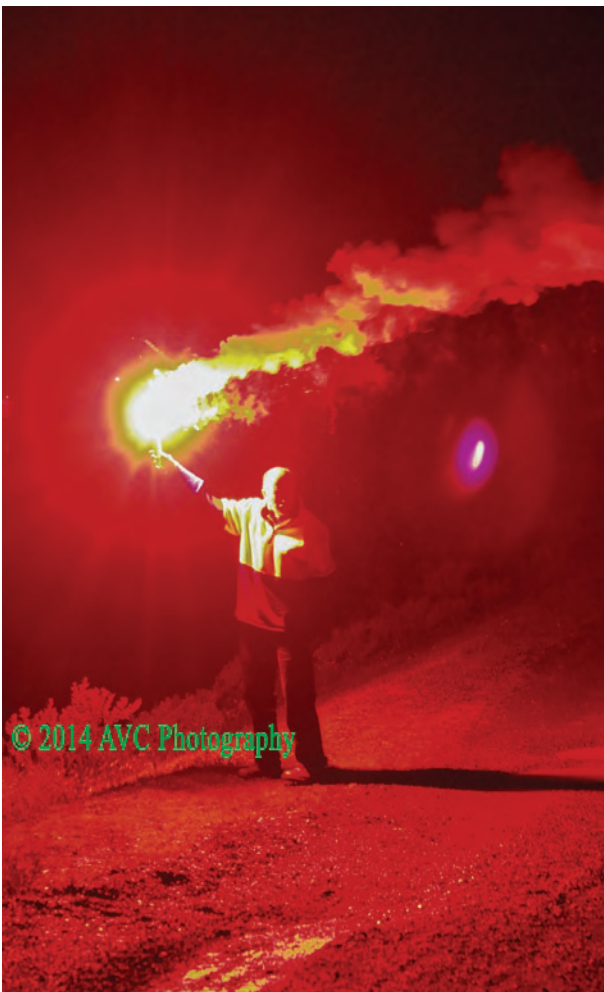
'I see red' at the recent GTYC flare demo