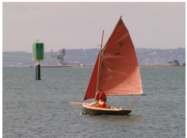
The gaff-rig was soon under way: pretty nifty set-up