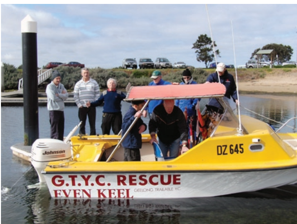
More OODs than you see on a month of Sundays!