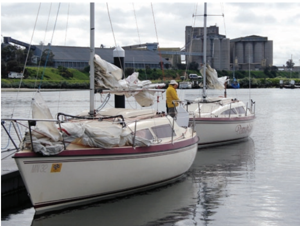
The fleet prepares: before the battle!