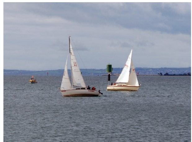
The fleet underway, at last!