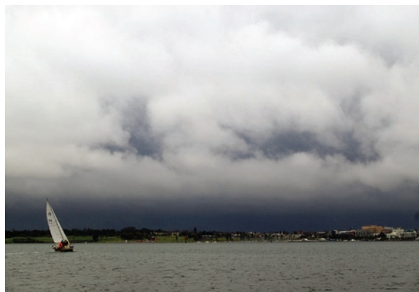
Charisma sails bravely into the rising storm

Once down at the first mark, all four boats tacked and then gybed as they worked their way around to port, then lined up for the long spinnaker run eastward to CB2.