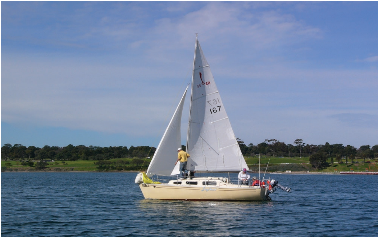
'Step Aboard' on her way to the west cardinal mark (on Corio Bay) during the GTYC's Spring Series Race 3

The quarterly newsletter of the Geelong Trailable Yacht Club Inc.