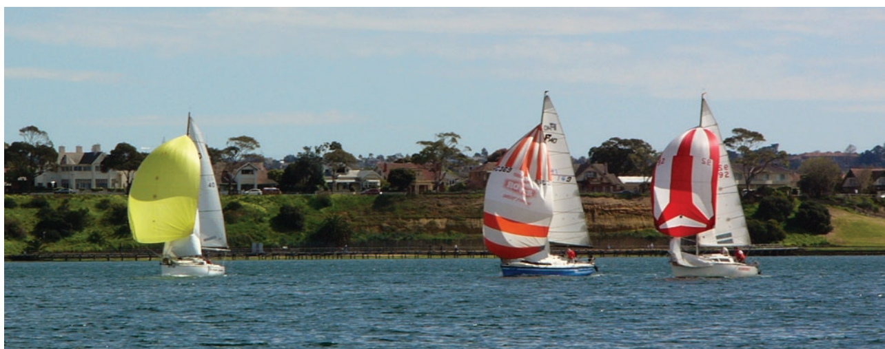
In near-perfect winter sailing conditions on Corio Bay, Five O'clock Somewhere and Farrcical sail neck and neck on the spinnaker run to the west cardinal mark.