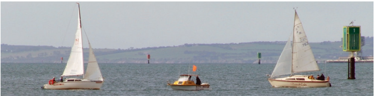
The fleet manoeuvring, just before the gun